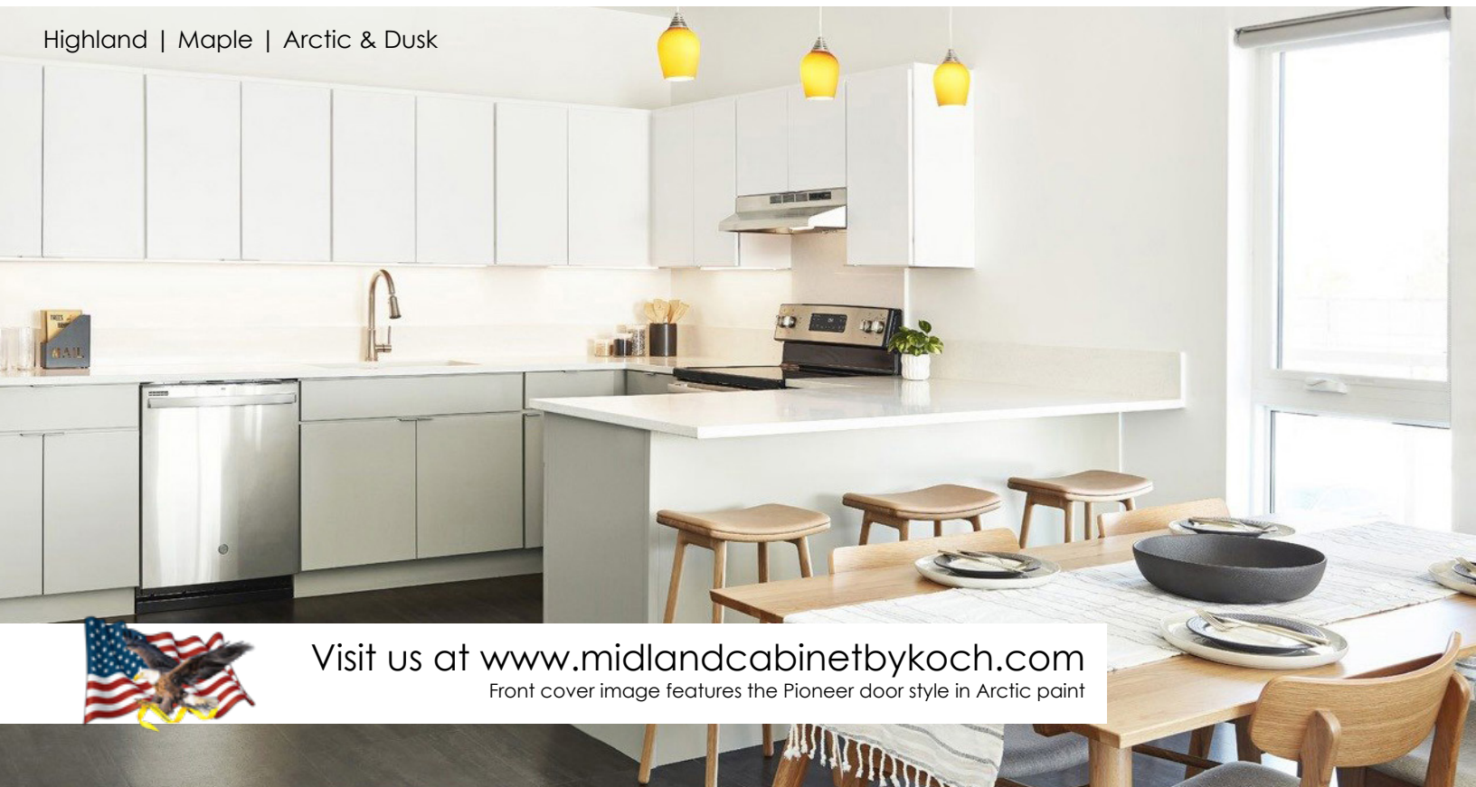
Highland | Maple | Arctic & Dusk