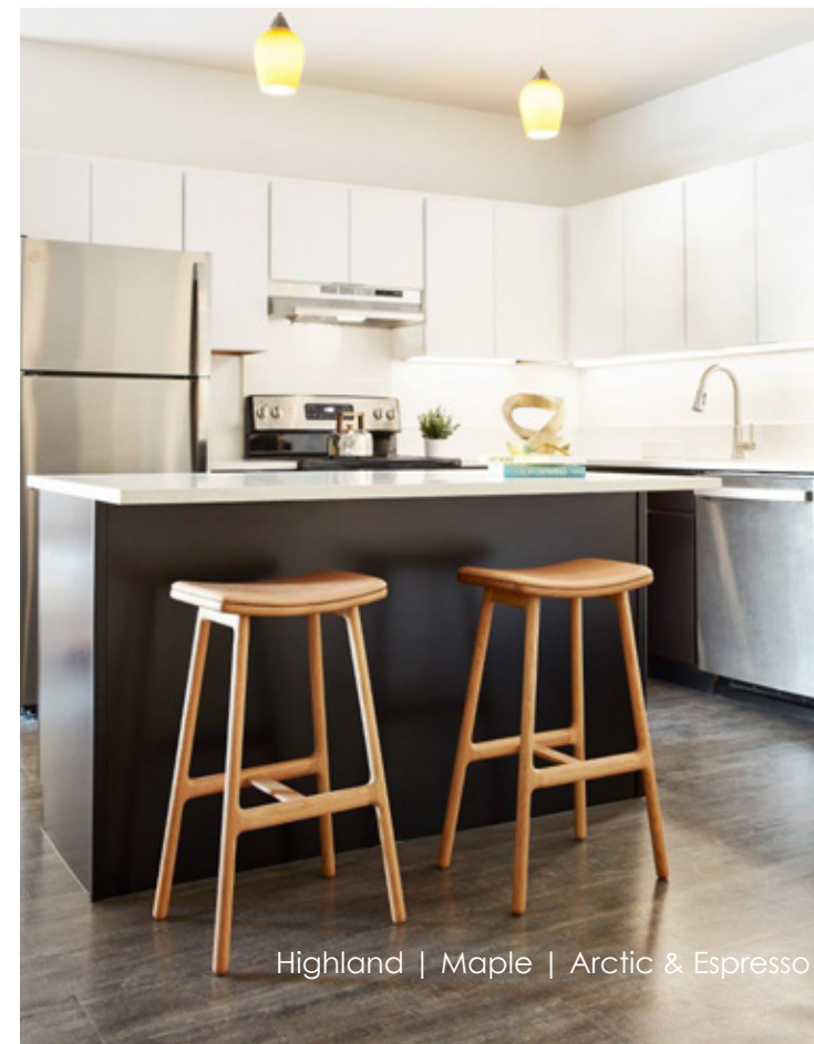
Highland | Maple | Arctic & Espresso