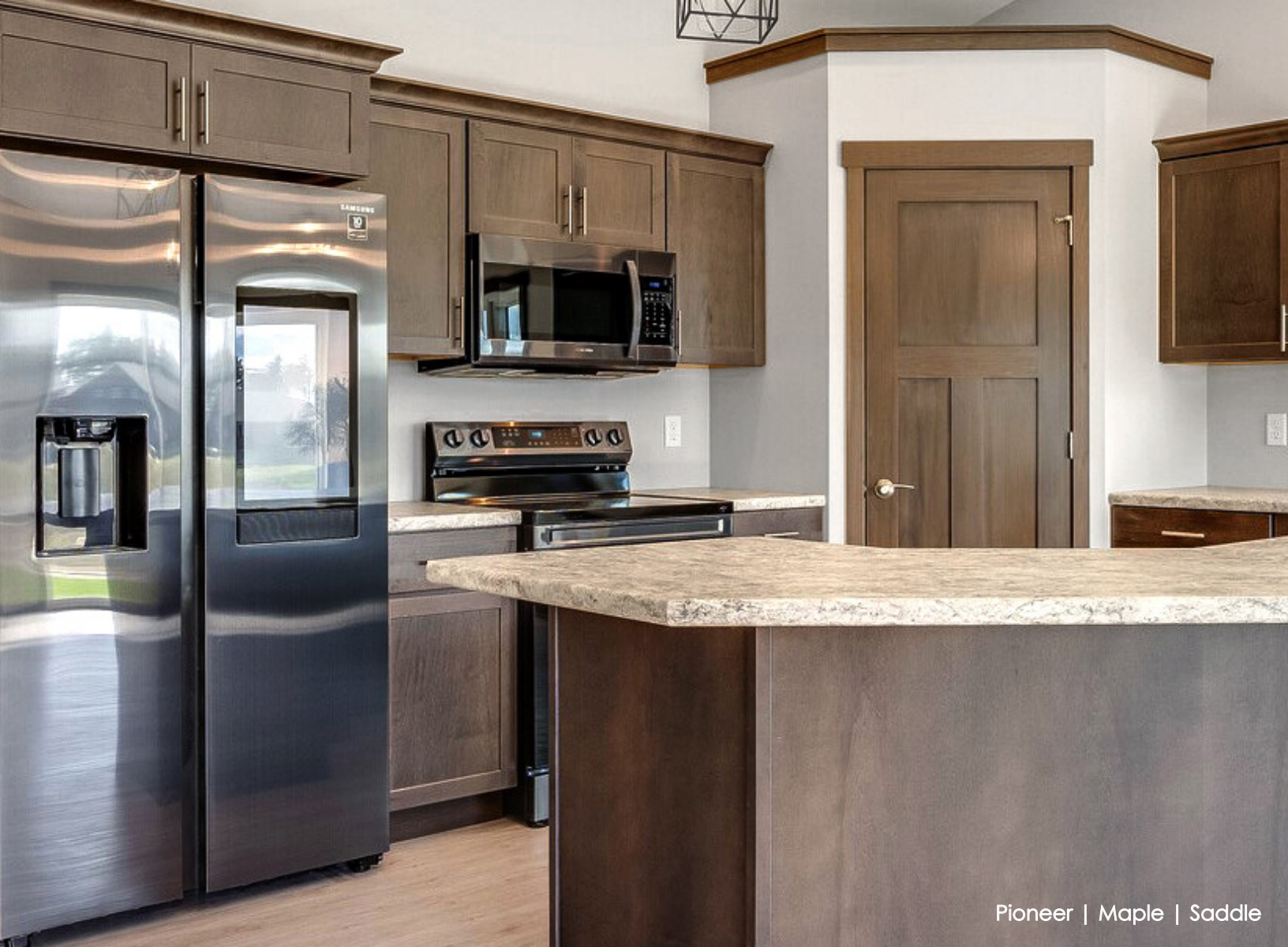
Pioneer | Maple | Saddle