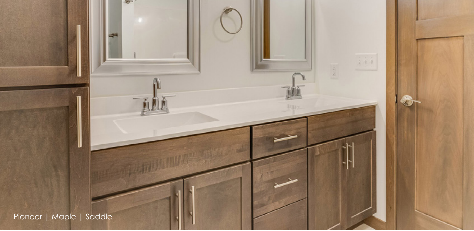
Pioneer | Maple | Saddle