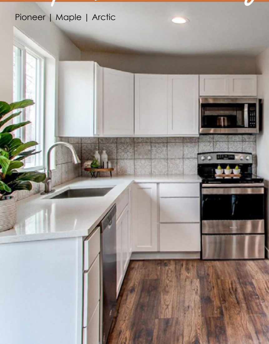
Pioneer | Maple | Arctic

Don't compromise quality for price. Midland Cabinetry delivers budget friendly, quality construction and finishes, making it ideal for single family and starter homes.